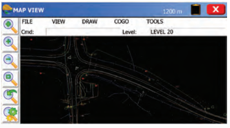
Combine and now integrate easily and quickly accurate measurements Total Station with Esri® MXD, MicroStation® DGN or AutoDesk® DWG formats.

The Esri<sup>®</sup> map is surprisingly sharp and clearly displayed in the field, including built-in zoom resolution, 'freeze / thaw'. This also applies to MicroStation<sup>®</sup> drawings. In both cases, there is no conversion, you work in the original map, and you can identify each feature, modify or expand through conventional snap selection. Land surveyors have access to the available Esri<sup>®</sup> maps of municipalities and water boards, utilities, state or national government, and SurvPC will automatically retrieve all map related attributes. There is no specific preparation necessary - the built-in Esri<sup>®</sup> engine reads and writes Esri<sup>®</sup> mxd documents allowing SurvPC to collect data and edit data directly into Esri<sup>®</sup> format. This makes it possible for surveyors and consultants to perform work in a uniform way for a variety of customers who make use of Esri<sup>®</sup> products, in an efficient manner.