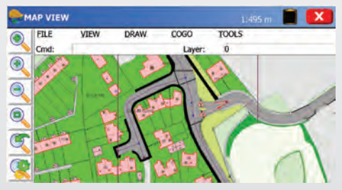
Updating maps has never been easier. The measuring and remeasuring of boundaries or plots can now quickly and easily be achieved with Carlson SurvPC